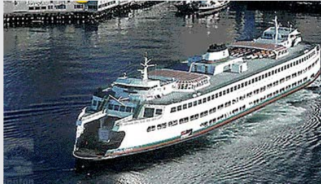
Enables car-free crossings and supports walk-ons