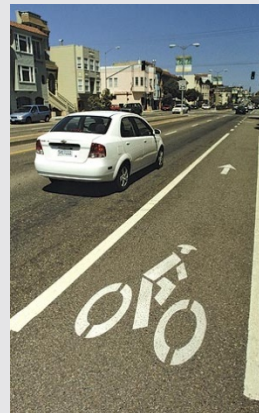
Preserves car-free lifestyles