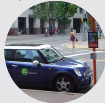
Real alternative to car ownership