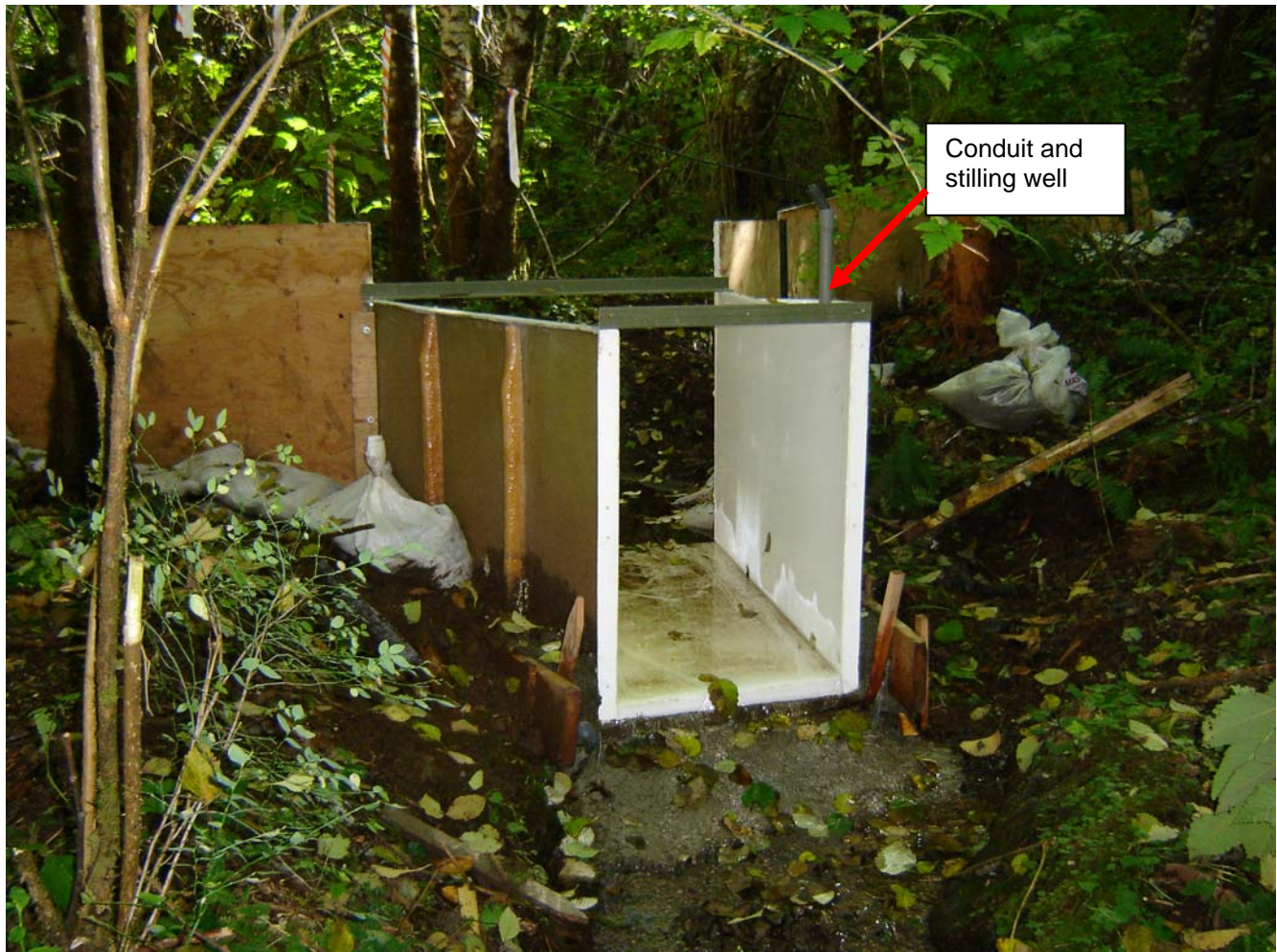
Figure 1. Flume installed in a Type N study stream. A pressure transducer housed within the conduit and stilling well measures stage height.