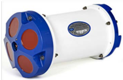
Figure 1. Workhorse Sentinel 300 kHz ADCP.