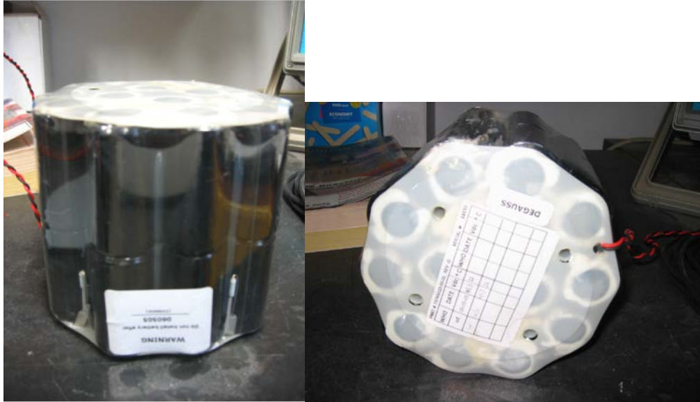
Figure 4. Fresh battery pack for fixed- or bottom-mount deployment.