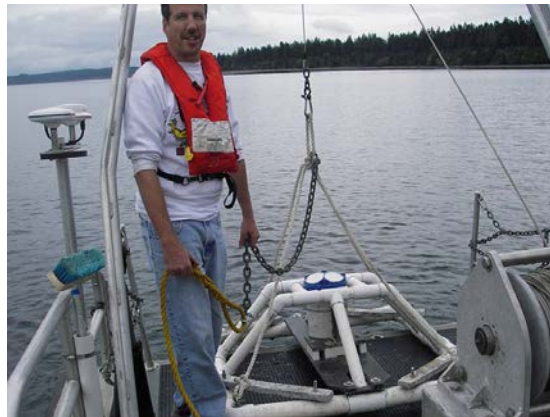
Figure 5. ADCP in mount ready for deployment with A-frame on R/V Skookum.