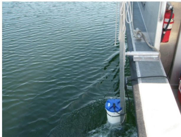
Figure 3. ADCP mounted on R/V Skookum (secured with redundant lanyard).

The pinger is an aid to recovery for SCUBA divers, and the snag-line can be grasped from the surface with the aid of a grappling hook. Normal recovery is accomplished with the aid of an acoustic release, which can be tripped with a hydrophone from the surface to release a buoyant vinyl (“Viny”) float with a line attached. In addition, a time-out release (e.g., http://www.subseasonics.com/trelease.htm ) is recommended as a back-up, especially on deployments deeper than 30m.