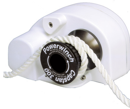
Figure 7. Power windlass secured by capstan on Skookum to raise ADCP (missing actual photo).

case (heavily stratified) you can be right over the release and not be able to get sound to it. Be aware that each release has a specific frequency (e.g., 10 kHz) and a release code (e.g., 'A') that have to be selected by the operator in order for the release to work. Try the procedure several times and keep watch for the float (it may come up under the boat, so don't have the propeller in gear). If you are successful, use a boat hook to retrieve the float and line. Lead the line up and over a block in the A-frame and to the anchor windlass specially designed to retrieve this tackle (Fig. 7).