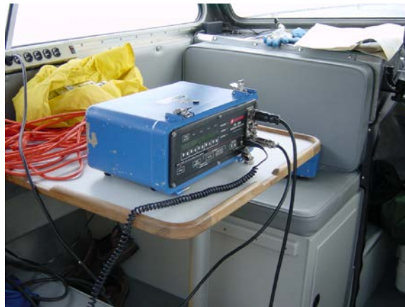
Figure 6. Benthos-type deck box plugged into 110 VAC with hydrophone attached.

case (heavily stratified) you can be right over the release and not be able to get sound to it. Be aware that each release has a specific frequency (e.g., 10 kHz) and a release code (e.g., 'A') that have to be selected by the operator in order for the release to work. Try the procedure several times and keep watch for the float (it may come up under the boat, so don't have the propeller in gear). If you are successful, use a boat hook to retrieve the float and line. Lead the line up and over a block in the A-frame and to the anchor windlass specially designed to retrieve this tackle (Fig. 7).