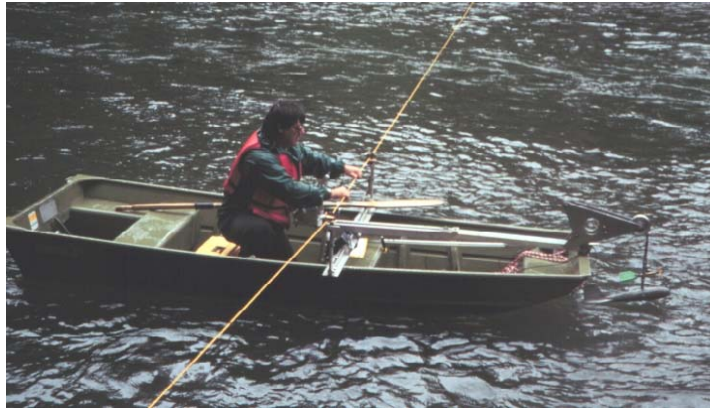
Figure 3 A boat measurement conducted with necessary equipment attached to a Kevlar® tag line.