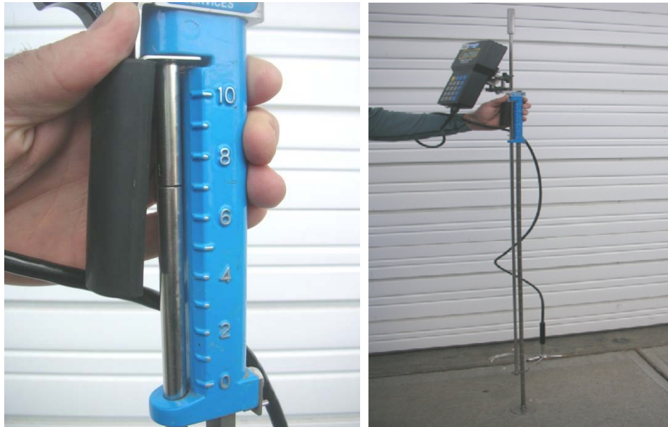
Figure 10 Wading rod with meter set at six tenths of a depth of 1.7 feet.