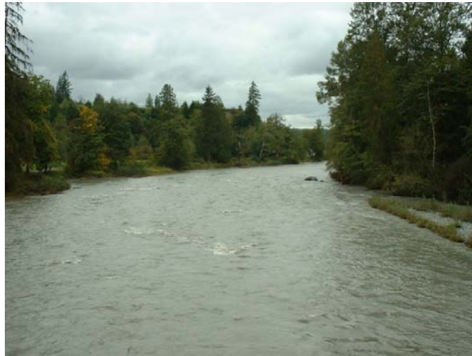
Figure 8 An example of channel control at the same location as figure 7.

6.12.5.1 Channel control exists when the physical attributes of a long reach of the channel controls the relationship between stage and discharge. These physical attributes include shape, length, width, slope, sinuosity, and roughness of the channel. The length of the channel as an effective control increases as discharge increases (Rantz, 1982).