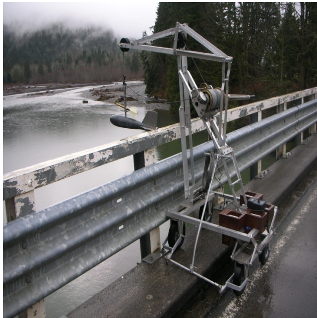
Figure 2 Bridge crane equipped with a USGS Type B reel.