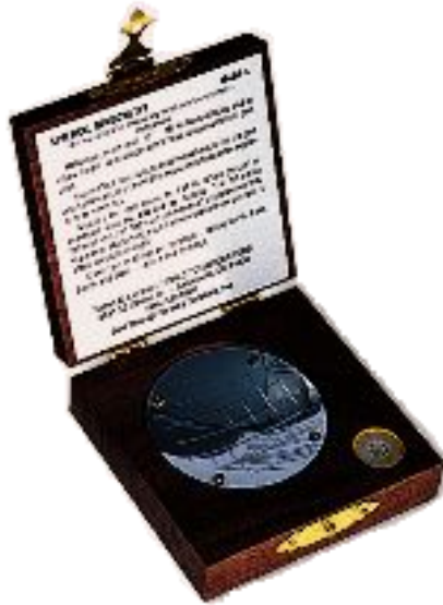
Figure 1. Concave Spherical Densimeter – Model C

3.5 Transect: a line which crosses perpendicular to stream flow across the bankfull channel; each site for the ERST project has six transects