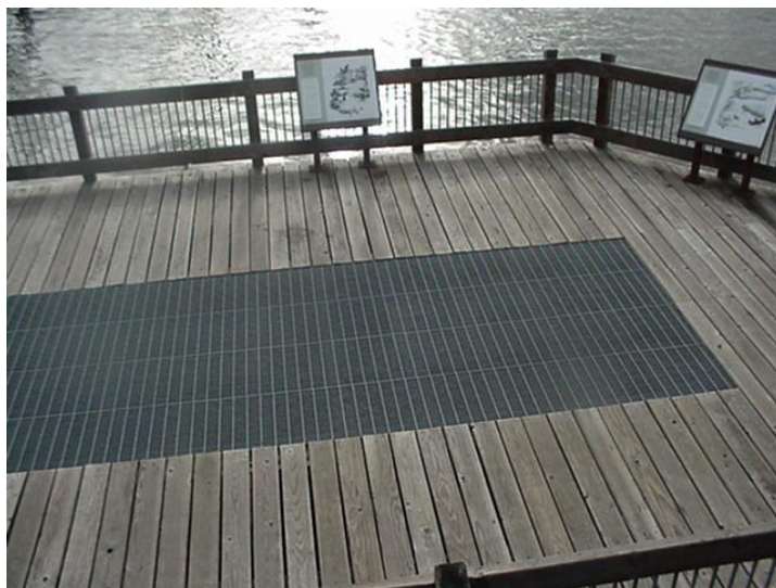
Figure 6: The City of Raymond's community pier includes grating to allow light to reach the water.