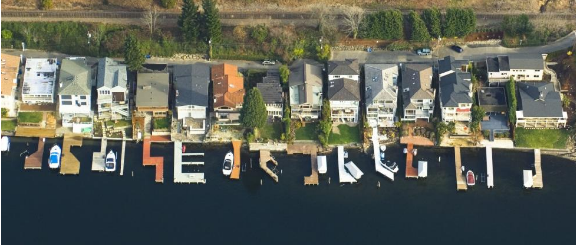
Figure 7: The density of docks, like these in Lake Washington, can make navigation difficult for local boat owners.

available to all citizens equally for the purposes of navigation, conducting commerce, fishing, recreation, and similar uses. Private ownership of the underlying land does not invalidate this trust.