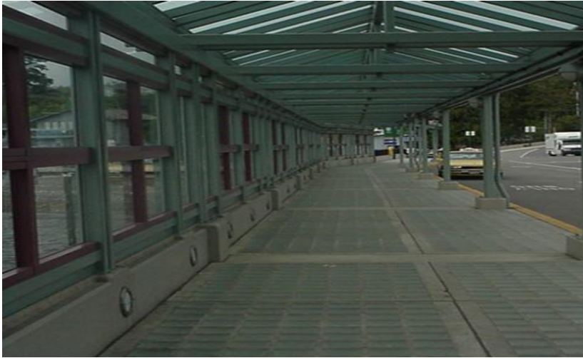
Figure 5: Glass blocks at the Clinton ferry terminal allow light to pass through to the water below. Glass blocks must be kept clean to be effective.

Some additional recommendations from Ecology: