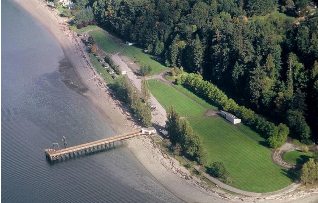
Figure 3: The 300-foot pier at Kayak Point County Park in Snohomish County provides opportunities for fishing and crabbing.