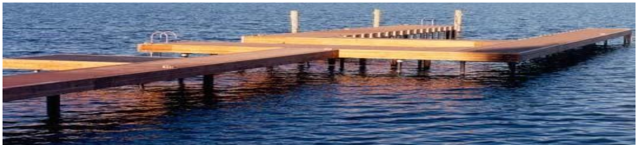
Figure 1: Piers, docks, and boat launches come in various shapes and sizes to provide access to the water.

Shoreline Master Programs should include policies and regulations regarding piers, docks and other overwater and in-water structures. SMPs will not be adequate if they only refer to and rely on state and federal agency documents, such as the Army Corps of Engineers Regional General Permits.