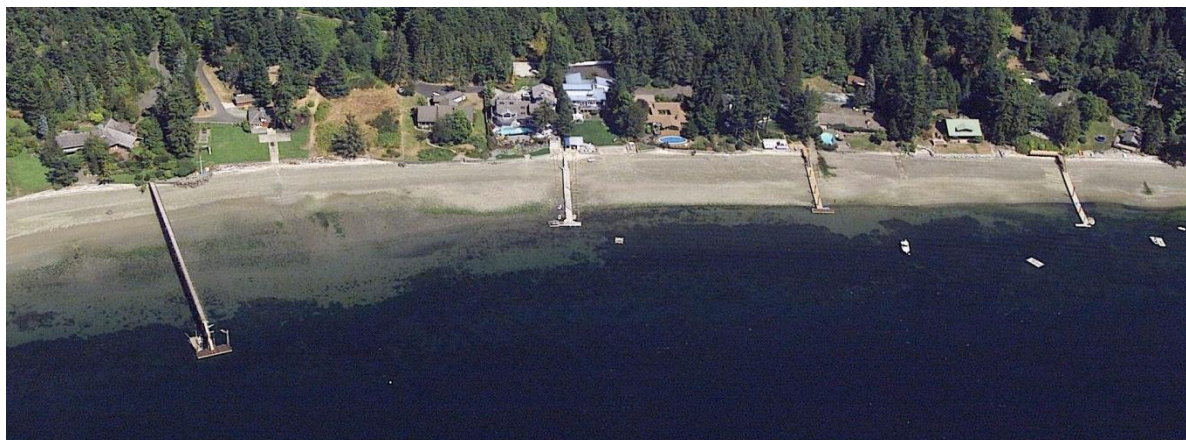
Figure 8: Piers on Horseshoe Bay in Pierce County extend out to reach the water during low tides.