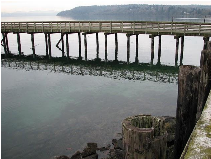
Figure 4: A pier in Tramp Harbor, Vashon Island, casts a shadow on the water.