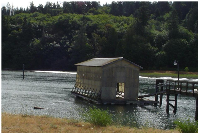
Figure 2: A boat house on Whidbey Island shelters the boat from the weather.

• Mooring buoys typically include an anchoring system with an anchor and anchor line, a float marking its location, and a fitting for a vessel's mooring chain or hawser. Washington laws establish two categories for mooring buoys -- commercial and recreational (RCW 79.105.430). Commercial buoys are typically used for temporary moorage of a vessel that is awaiting transit or loading or offloading. Recreational buoys are used as semi-permanent moorage for recreational vessels.