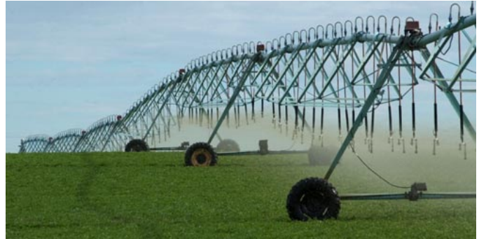
A center pivot irrigation system delivers water in Eastern Washington where the Lake Roosevelt agreements hold the promise of reducing farmers' reliance on the Odessa aquifer which is dropping rapidly each year.

In partnership with The Confederated Tribes of the Colville Reservation, The Spokane Tribe of Indians, and the U.S. Bureau of Reclamation, Gov. Chris Gregoire has signed agreements to manage the Lake Roosevelt withdrawals. The Tribes are key partners because their