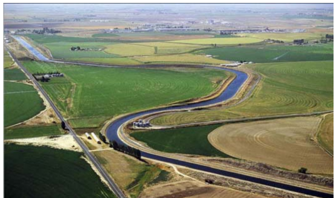
An aerial photo shows some of the Eastern Washington farmland that will get new irrigation water from Lake Roosevelt under agreements signed with the Confederated Tribes of the Colville Reservation and the Spokane Tribe of Indians.