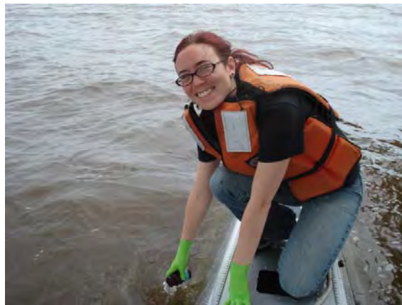
Department of Ecology employee collects a water sample in Hood Canal.

Oyster farmers started to worry in 2005 when oysters failed to reproduce in Willapa Bay. New sets of oyster seed in Willapa Bay failed again in 2006, 2007, 2008, and 2009. During this same time, two of the West Coast’s larger shellfish hatcheries experienced major problems producing Pacific oyster seed. Although the cause has not been determined, corrosive waters may have contributed to the declines in oyster survival.